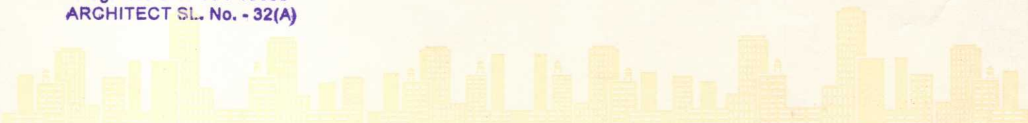
J.P. Agrawal JAY PRAKASH AGRAWAL B. ARCH., A.I.I.A Reg. No. CA / 86 / 10098 ARCHITECT SL. No. - 32(A)